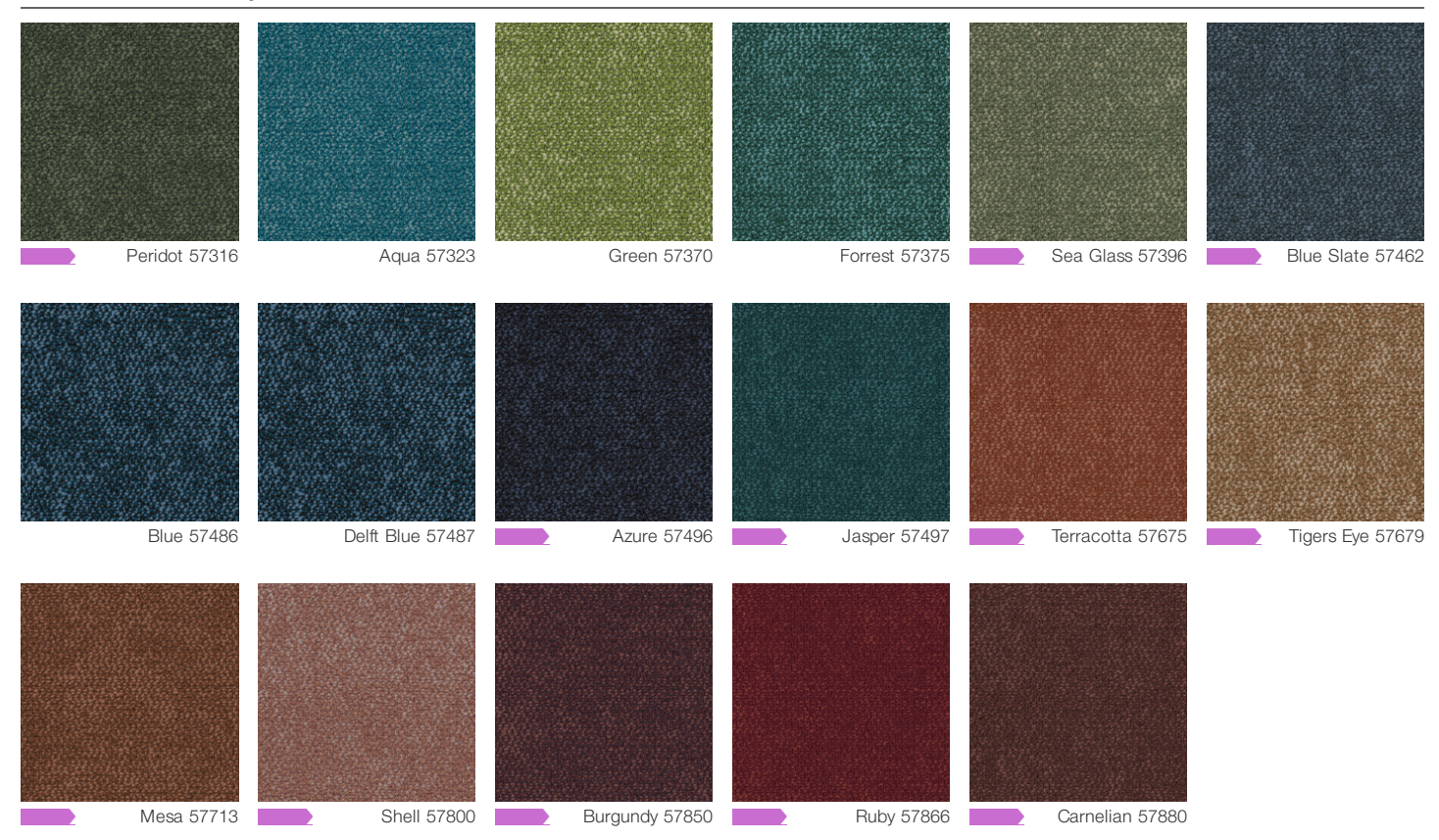
Quick Ship 4 Weeks